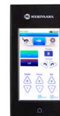
Table movements are easily selected from the touch screen and activated with two colour-marked buttons.

When using Merimote to control the surgical lights and operating tables, nursing staff get even more time to focus on the patient.