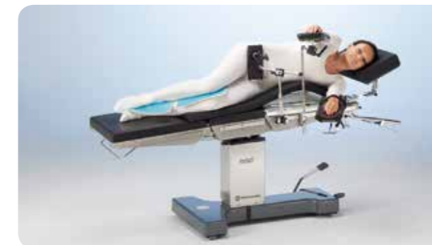
General surgery in lateral position, kidney/ thorax surgery with flex or separate kidney elevator