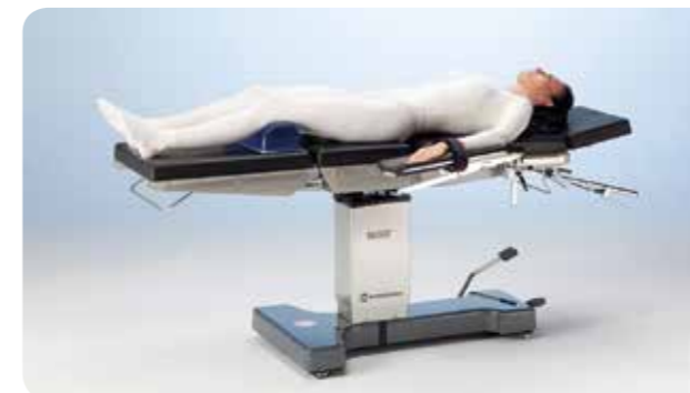
General surgery, ENT/Struma