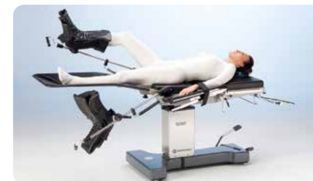
Preparation for lithotomy position