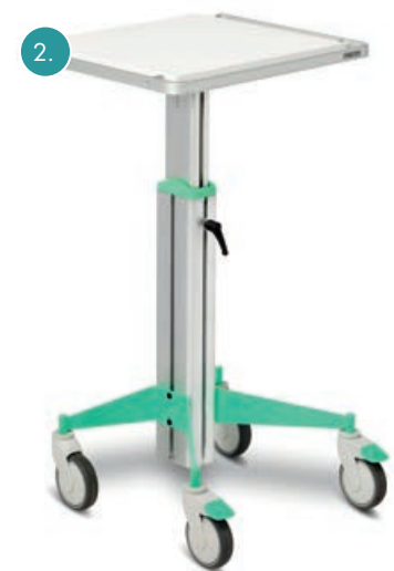
Large, high-quality castors provide excellent mobility.