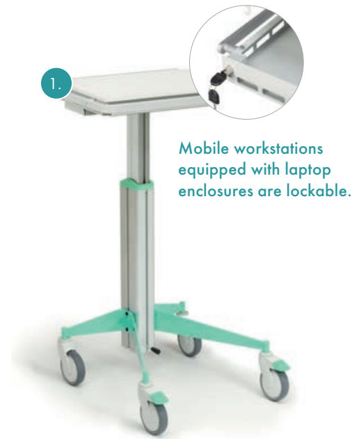
Mobile workstations equipped with laptop enclosures are lockable.